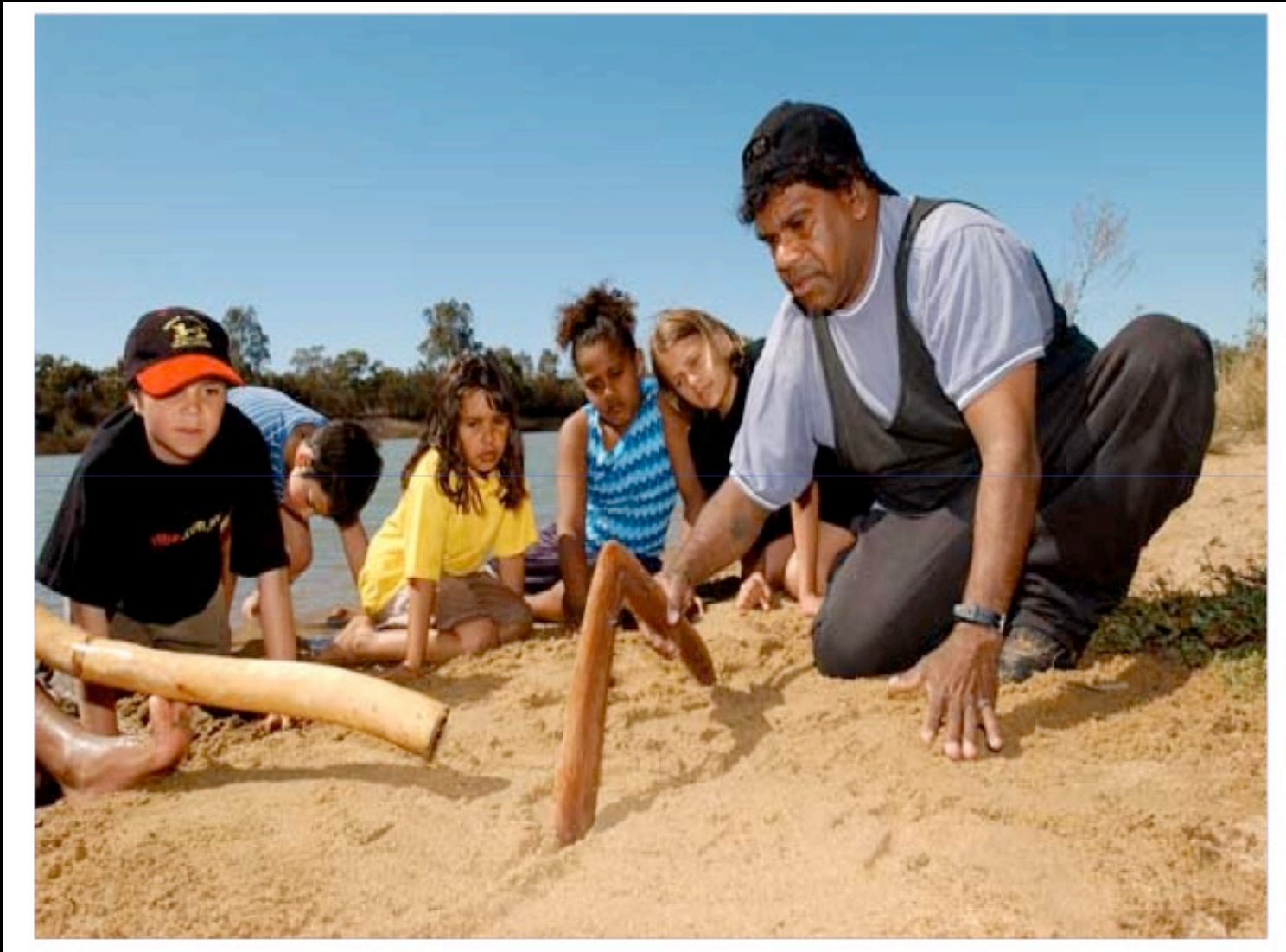
Murray River Band, Australia - traditional ecological knowledge & cultural flows

Indigenous peoples should be recognized as rightsholders who share in the benefits of hydrodevelopment and have the power to say no.