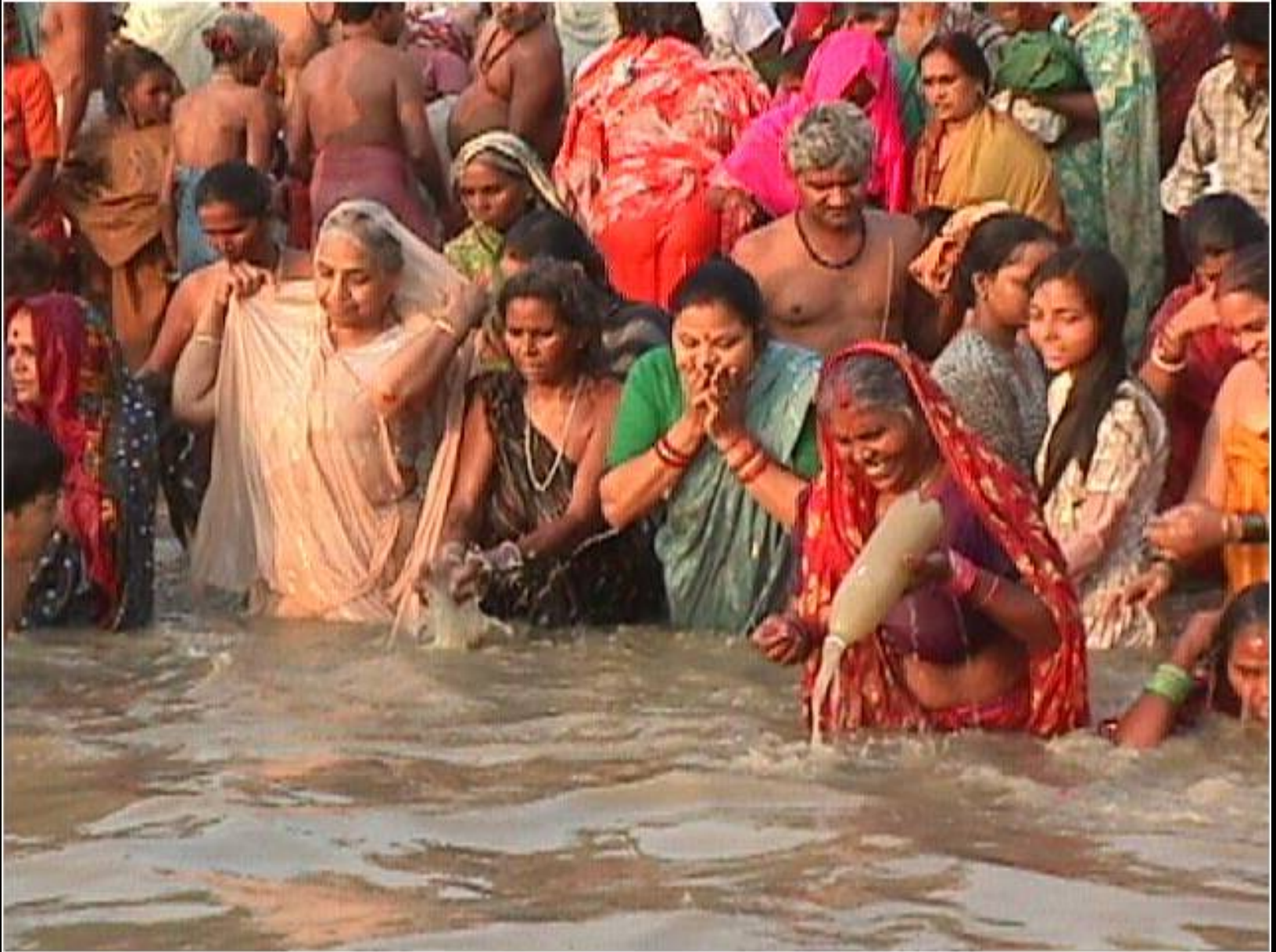
Ganges River, India.