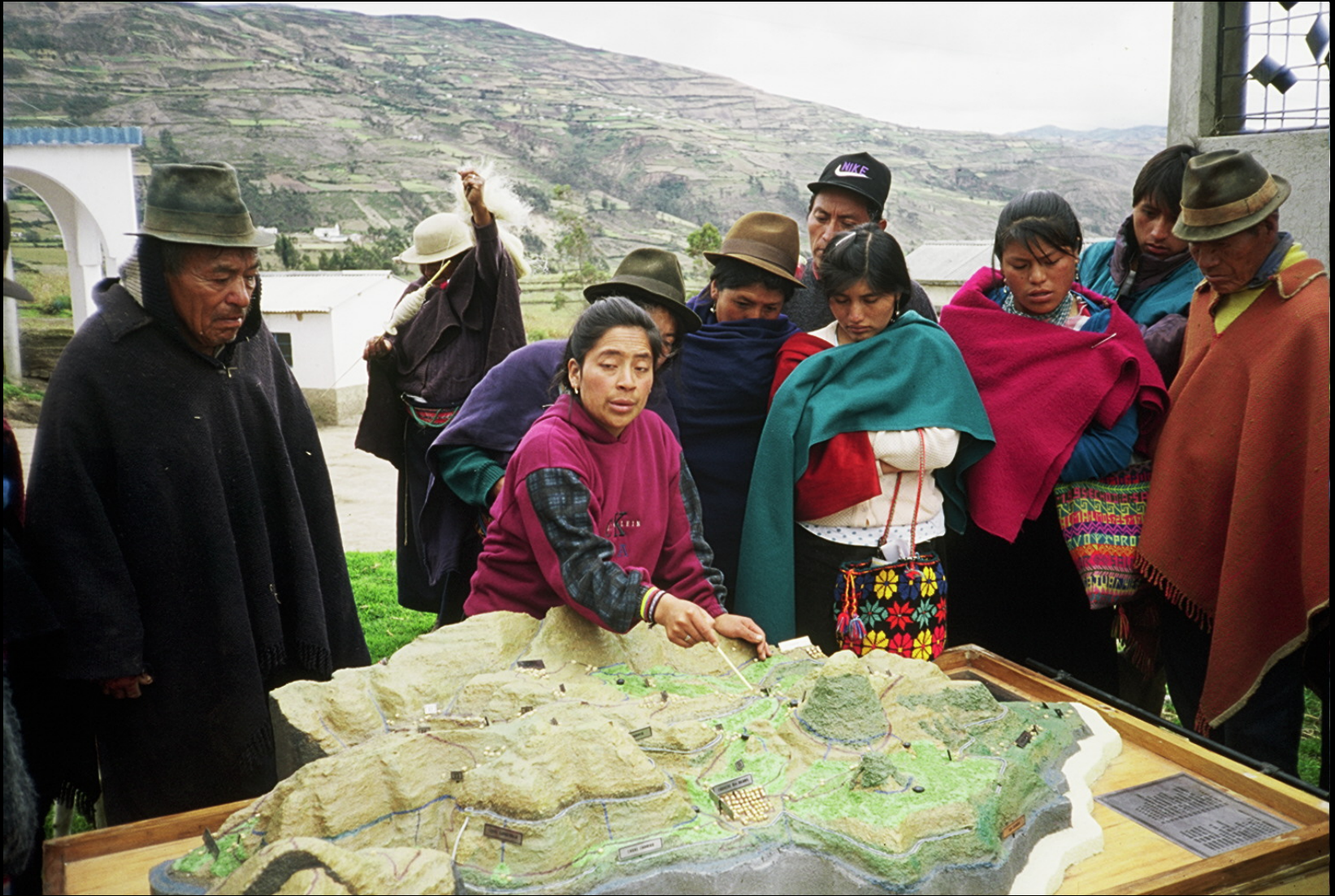
Female campesina promotor training her fellows on water design, Ecuador

Water culture - reproduces sociocultural values... sustains societies, economies, environments