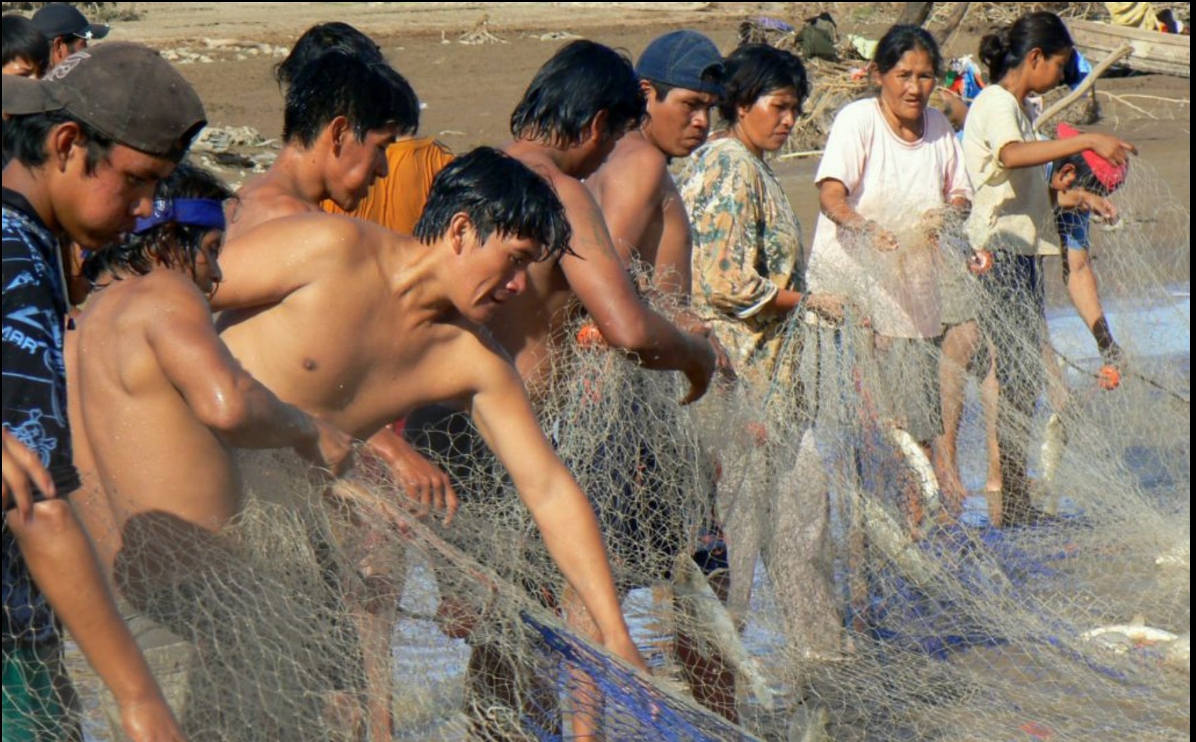
Indigenous fishing - annual migration up Pilcomayo River, Bolivia.